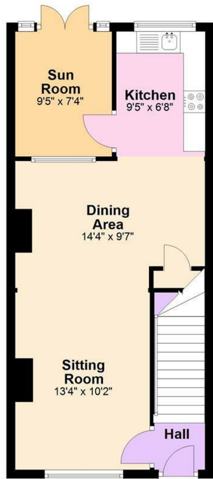
Ground Floor Approx. 518.0 sq. feet